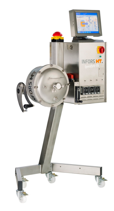
Fig. 1: INFORS HT Terrafors

Inoculation was made by adding 2 strips of agar containing fungi of strains TF-84 and TF-85. The substrate and inoculum were then mixed by rotating the chamber at 5 rpm clockwise (+5 rpm) and anticlockwise (-5 rpm) at 10 minute intervals for 1 hour. Mixing was then set to zero.